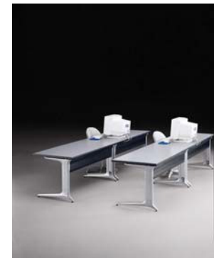
Table finishes are to be the same as adjustable ADA tables – see below.